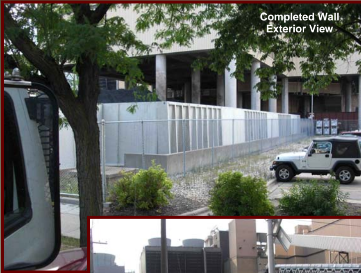
Completed Wall Exterior View