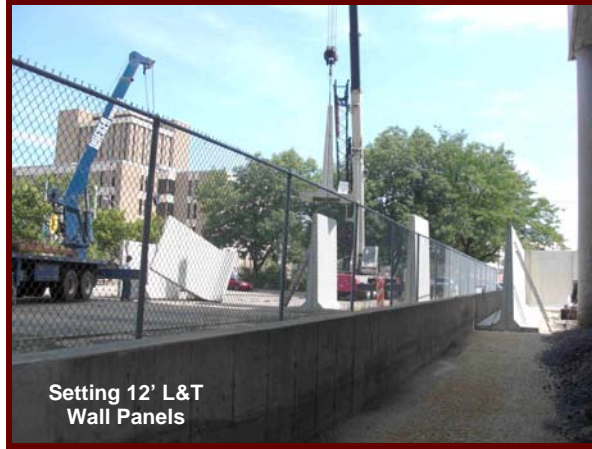
Setting 12' L&T Wall Panels

Wieser Concrete continues its tradition of providing our customers with quality, innovative product and the service they need and deserve.