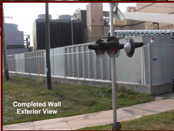
Completed Wall Exterior View