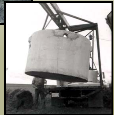
Setting the First Tank Produced by Wieser Concrete in 1965